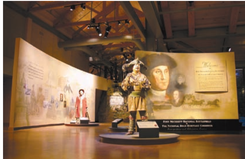
The Visitor Center at Fort Necessity

Learn more about Fort Necessity at its website: www.nps.gov/fone/index.htm